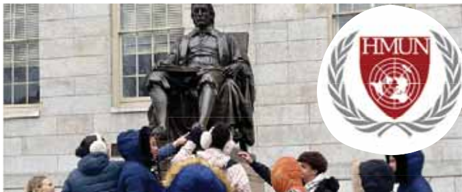
Pretending to kiss the toe of John Harvard