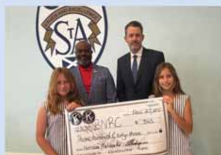
Photo booth Fundraiser